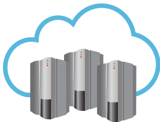
RISCO Cloud Server

ProSYS™ Plus was designed with the understanding that reliable communication is crucial for commercial installations. Not only does it enable you to utilize all of the latest communication technologies available like multi-socket IP, 3G and WiFi, but it also supports the configuration of multiple paths to ensure the full redundancy and resiliency of the communication.